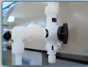
3 way valve for calibration and drip tray for measuring jar