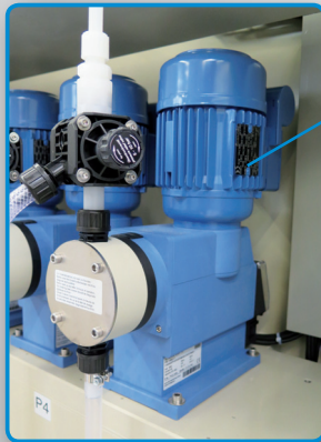
Ecolab diaphragm pumps with overpressure safety valves and/or snubbers against pressure shocks