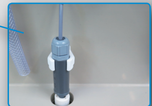
Quick acting leak detection